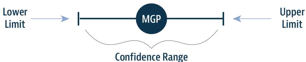
Figure 2. MGP & Confidence Range

In addition, MGPs also are reported with an upper limit and a lower limit that represents a 95-percent confidence range (see Figure 2 ).