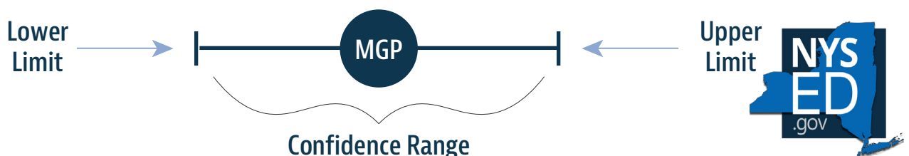
Figure 3. Growth Measures & Upper & Lower Limits

All growth measures are reported with an upper limit and a lower limit that represents a 95-percent confidence range (see Figure 3).