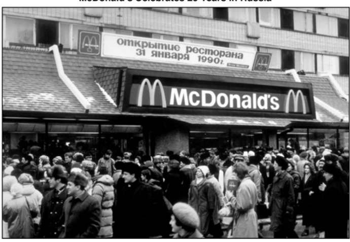
McDonald's Celebrates 26 Years in Russia

One of the world's biggest chains of fast-food restaurants marked its 26th anniversary of business in Russia Saturday, Jan. 31. The first McDonald's was opened in 1990 on Pushkin Square in Moscow, one year before the collapse of the Soviet Union, and became a pioneer for the many foreign food chains that flooded Russia afterward. The restaurant was temporarily closed by the state food safety watchdog in August last year [2015], and reopened in November. Nowadays 471 McDonald's restaurants serve more than 950,000 customers per day in Russia.