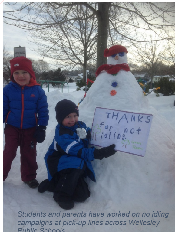
Students and parents have worked on no idling campaigns at pick-up lines across Wellesley Public Schools.

The WPS Bates School was the first in New England to participate in the EPA's Food Recovery Challenge. After assessment, goal setting, and project implementation, the resulting recycling and food waste diversion project resulted in a 40 percent reduction of the school's cafeteria waste. Now, the program has been expanded to two more elementary schools, which are implementing share tables, aiming to eliminate food waste, and providing food to those in need. In addition, all WPS cafeterias across the district now collaborate with area colleges as part of a Food Recovery Network to donate unused, cooked food to Food For Free, a Cambridge-based nonprofit. Food For Free distributes single-serve meals to people who are food insecure, including students at MassBay