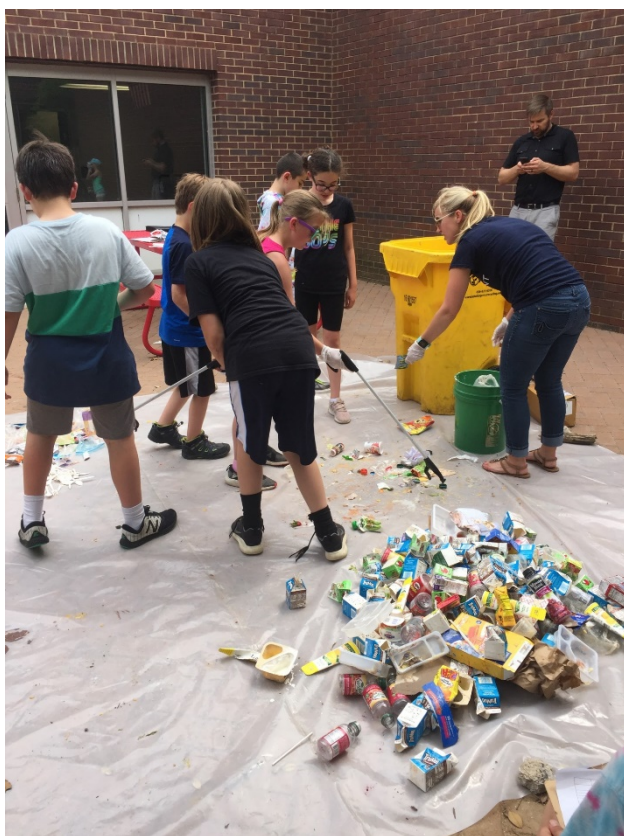
Students worked with the Parkway School District Director of Sustainability and Purchasing to conduct an audit of waste materials from a given day at Claymont Elementary School.

District programs ensure that building materials meet volatile organic compound (VOC) standards, while lead and asbestos management plans and an IAQ task force ensure that Claymont is a healthy place to learn and work. Physical and mental wellness programs for both students and staff help to ensure needs are being met with support. The green team has begun work on an indoor tower garden to bring fresh produce choices to the daily lunchroom salad bar. Claymont offers the staff a variety of wellness activities, as well as Pilates and yoga classes. Additionally, staff benefit from a book club, flu shots, and healthy luncheons.