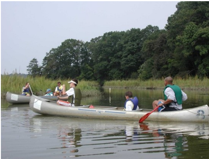
Calvert County Public Schools seventh grade students prepare to rake for submerged aquatic vegetation on Cocktown Creek.

The first Calvert County school was certified as a Maryland Green School in the spring of 2009. Now all 24 prekindergarten through grade 12 schools, as well as and one technical academy in the district, are certified Maryland Green Schools, making Calvert the only county in the state to have 100 percent of its schools certified in this statewide program. The vast majority also participate in at least one other green school certification program. NWF's Eco-Schools USA is an internationally recognized school sustainability program. A school striving to become an NWF Eco-School can pursue sustainability pathways as it progresses through the seven-step process. There are 22 CCPS institutions currently registered as NWF Eco-Schools.