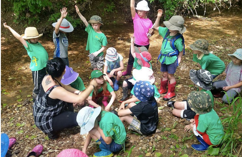
Raintree School students participate in circle time in a forest clearing.

Raintree's greatest waste-reduction efforts come from composting 53 percent of food waste for use in the gardens. All paper, plastic, and glass are recycled or reused on campus. More than 50 percent of school supplies are made from repurposed material from recycled goods warehouses. Kitchen policies have stopped the use of plastics and no disposables and ardently support reusing leftovers. One-third of the paper on campus was once-used and is supplied by area