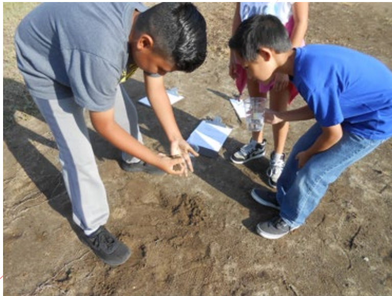
Rialto Unified School District fifth-graders plan their garden and test soil quality.

From February 2014 to October 2018, RUSD realized a 23 percent reduction in electrical energy usage and a 12.5 percent reduction for water and sewer usage. RUSD contracts with Cenergistic, and it funds a full-time energy manager. The district tracks energy usage using Energy Cap software. In its latest EPA ENERGY STAR report (March 2016), 96 percent of RUSD schools documented an ENERGY STAR score of 70 and above, with a mean score of 91 and a median score of 94. In 2015, the board approved the installation of solar panels at all school sites by SunEdison (now Onyx Solar). The completed project has a total capacity of 7,800 kilowatts, which meets 80 percent of district needs. For the 20 percent of energy purchased, renewable energy comprises 25 to 28 percent of the companies' portfolios. Other recent projects have replaced inefficient transformers, installed motion sensors and low-flow fixtures, and added cool roofs, LED lighting, and skylights.