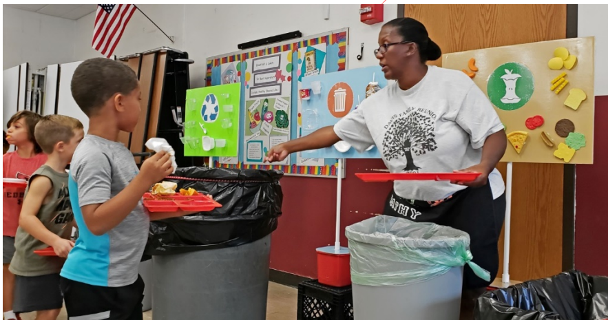
At Bloomington Public Schools' Bent Elementary School staff members help direct students to recycle, landfill, and compost bins.

Since 2015, the district has reduced electricity use by an average of 34 percent annually and reduced gas use by an average of 47 percent annually, resulting in a total energy savings in excess of $500,000 each year. This energy efficiency was