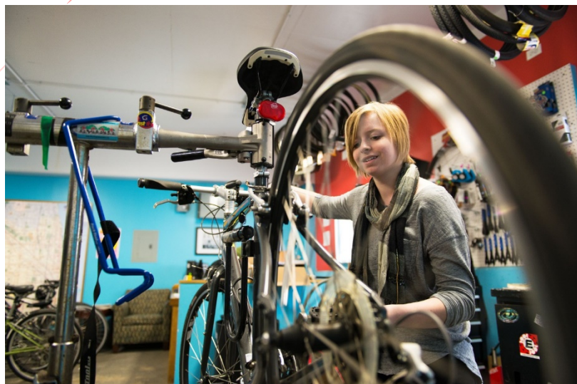
One of Loyola's student-run businesses, Chainlinks is a full-service bike shop and rental program. Loyola also encourages alternative transportation with electric vehicle charging, protected bike corrals, transit passes, and discounted bike share participation.

Due to the urban nature of Loyola campuses, over 95 percent of students and 70 percent of employees take a sustainable transportation option while commuting, such as public transit, biking, or walking. Loyola supports these efforts with discounted bike share and transit benefits. The Lake Shore campus of Loyola is on the shores of Lake Michigan; it is a model for coastal development