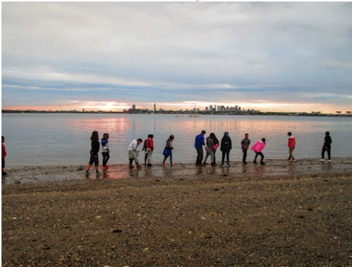
participation in camping, hiking, canoeing, cross country skiing, and snowshoeing.

The school adheres to district policies for green cleaning, integrated pest management, environmental audits, and no-idling, among other areas of school environmental health. BGA's chemistry teacher is trained and supported by Beyond Benign, a nonprofit that provides educators with the skills and tools to teach green chemistry in their classrooms and laboratories. The Office of Counseling and Wellness consists of social workers, guidance counselors, counseling interns, and a school nurse. To support school culture, BGA incorporates restorative justice approaches and other social-emotional learning models.