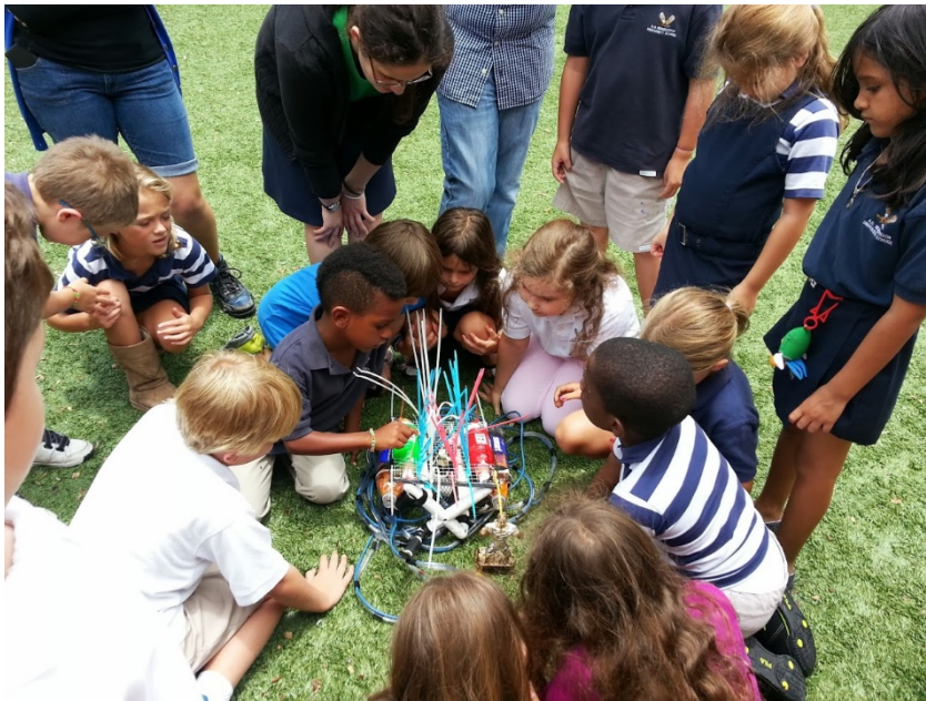
Florida Atlantic University Lab School District kindergarten and first grade students assemble an underwater robot using recycled products.

Hydroponic gardens as well as a butterfly reading garden have been added to various school grounds to encourage use of the lush outdoor areas and beautiful Florida weather. Additionally, the district expanded two outside classroom gardens, including variable systems such as aquaponics, vertical hydroponics, horizontal hydroponics, raised bed gardens, barrel gardens, and a new research-based aquaponics lateral system. These gardens were built in the center of the high school for all students to observe, learn, and participate in care and maintenance. Cistern and rain barrel systems reuse greywater to irrigate plants.