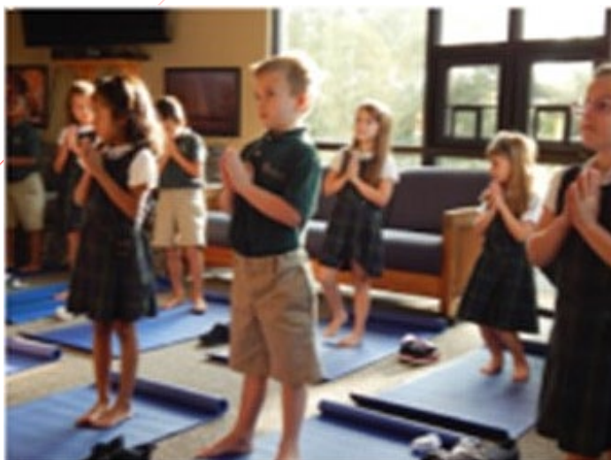
Several Immaculata Catholic School teachers, especially first and second grade, use yoga in classrooms as a way of settling children when they first arrive; during indoor recess on rainy days; or before or after large exams for older students.

Middle-school students are tasked with examining efficient and low-cost irrigation solutions for the plants they are researching, and they are steered toward native North Carolina plants wherever practical to reduce reliance on auxiliary watering. Immaculata recently received a grant to support this garden and outdoor-classroom effort.