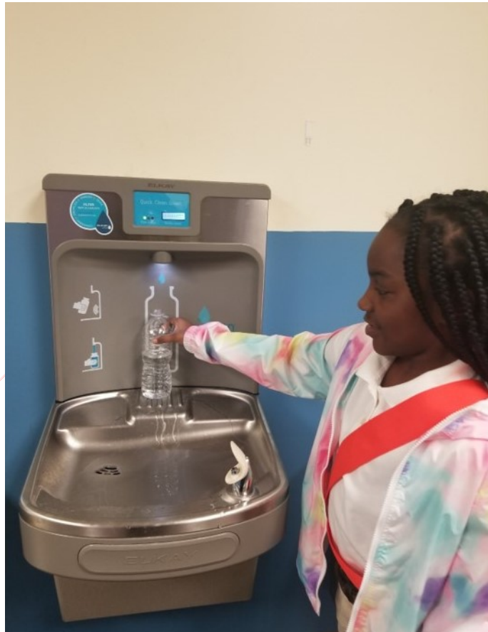
Students at Gadsden have water bottle filling stations available to them to encourage healthy hydration and reduced single-use plastic bottle use.

Students engage in five-minute brain breaks throughout the day to move their bodies and subsequently increase focus. Safer, Smarter Kids is an annual training session for students in kindergarten through fifth grade, teaching students how to better protect themselves from physical and mental abuse. A Character Counts program has been implemented, with six pillars of character development to help students exemplify appropriate behaviors and to provide a positive school climate. Coordinated Early Intervening Services and Dare to Be King programs focus on mental health, helping students learn how to deal with trauma and daily stressors. Gadsden's faculty and staff also participate in an annual "The Biggest Loser" wellness project to promote healthy