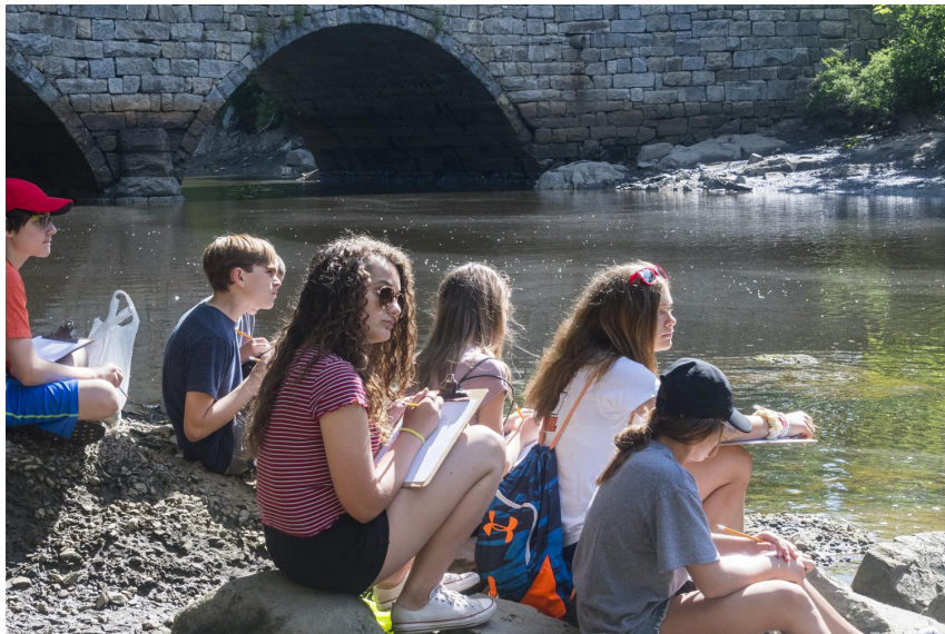
Seventh grade students at Ipswich Middle-High School spend two weeks on field trips learning about the history of the coastal town and how the environment has impacted it, including two days canoeing, conducting water quality tests, and learning conservation values.

Food grown in the school's garden is brought directly into the cafeteria for consumption, and extra produce is delivered to a local food pantry. In the IMHS cafeteria, salads and soups use the kale, chard, and carrots from the garden, which food service workers pick and serve the same day. The school also purchases locally from nearby farms.