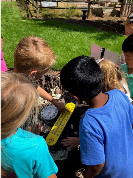
Students take measurements in the Sharon Elementary School Discover, Inspire, Grow, Succeed (D.I.G.S.) outdoor classroom.

The outdoor classroom includes a pergola with American Disabilities Act -compliant tables; a concrete path stamped with native Georgia animals and plants; a Georgia limestone amphitheater for outdoor lessons; a native rock garden containing marble, sandstone, limestone, and granite; a butterfly garden with organic milkweed for monarch butterflies; the beginnings of a loofah garden; a three-sided barn made of reclaimed wood; signage for self-directed learning; a tool shed; and a WeatherBug Station atop the school.