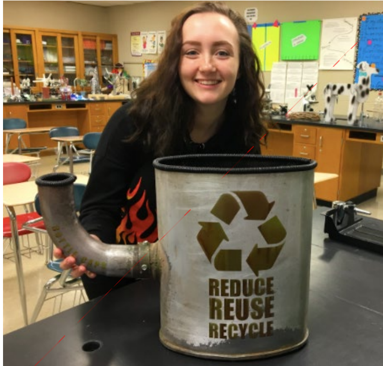
Working with her father, a Herculaneum High School student repurposed a muffler into a watering can.

Herculaneum has a high poverty rate. In ninth through 12th grade home economics classes, students learn how to purchase healthy foods on a budget and create healthy weekly menus. They also learn how to remake leftovers. The school recently received a grant to have a dentist and psychologist in the district, whom students and their families can visit any time during school hours. Families are encouraged both to donate and take any clothing items from the school's sharing closet. Herculaneum has an exchange program for household goods, where families are encouraged to volunteer or use to get items they need. Free breakfast is offered to all students. For staff, there are 3,000-steps-a-day and weight-loss challenges.