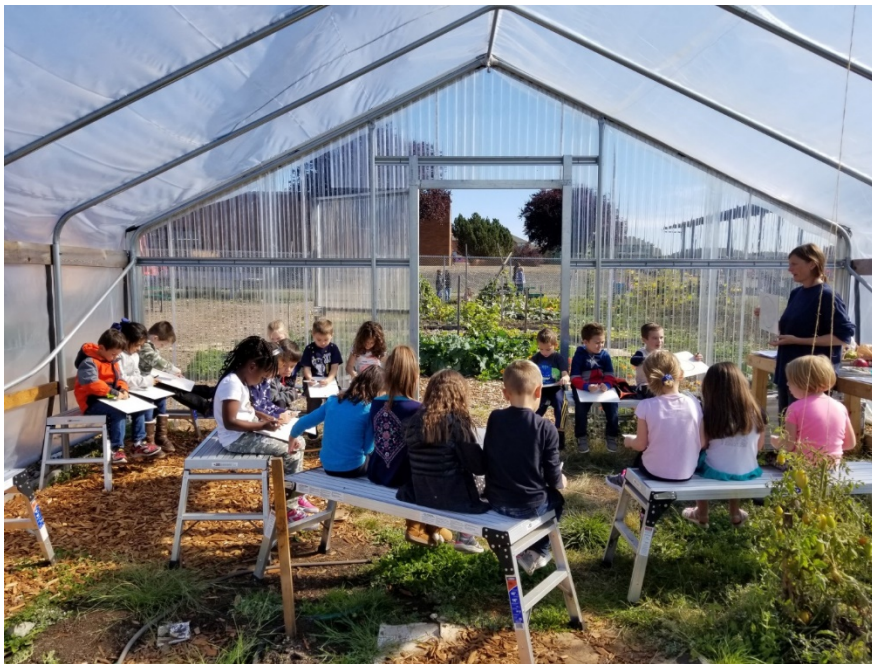
A Washington State University Master Gardener gives a lesson to kindergartners at Crescent Harbor Elementary.

What sets OHPS apart from neighboring districts is the schools' ability to work together to strengthen each other and grow. OHPS students and staff have engaged in projects that vary from schoolwide vermicomposting and recycling, to green classroom certifications in waste, water, and energy reduction, community work, designing and building tiny, high-tech homes for the homeless.