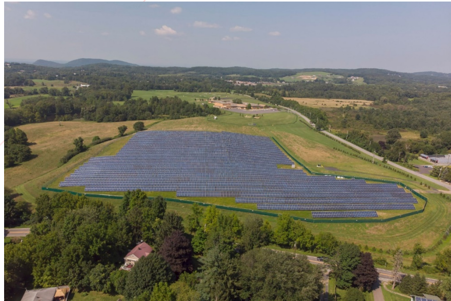
On the Warwick Valley Central School District's grounds is a 8800-panel solar field that generates enough energy for the whole district.

Warwick Valley Middle School educators, like their colleagues throughout the district, are required to incorporate sustainability and environmental concepts into curricula and class activities — and do so with creativity and enthusiasm. They often receive training and guidance from the Children's