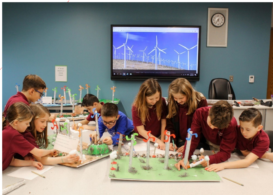
Saint Leo the Great students design and build wind turbines.

In 2014, the school's nature courtyard, located in the center of the school building, was designated by the National Wildlife Federation as a