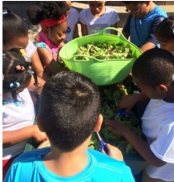
Second grade students at Captain James E. Daly Elementary School learn science and nutrition as they plant salad greens, care for them, collect data, and eat them.

Daly has one of the strongest and largest school-based School Energy and Recycling Team (SERT) groups among all elementary schools in MCPS, which consists of 40 fourth- and fifth-grade students and is led by a school counselor and the building service manager. While all schools in MCPS have school-based SERTs, Daly consistently has had the largest and most active school-based team. Green team student leaders wear SERT aprons and go through the building