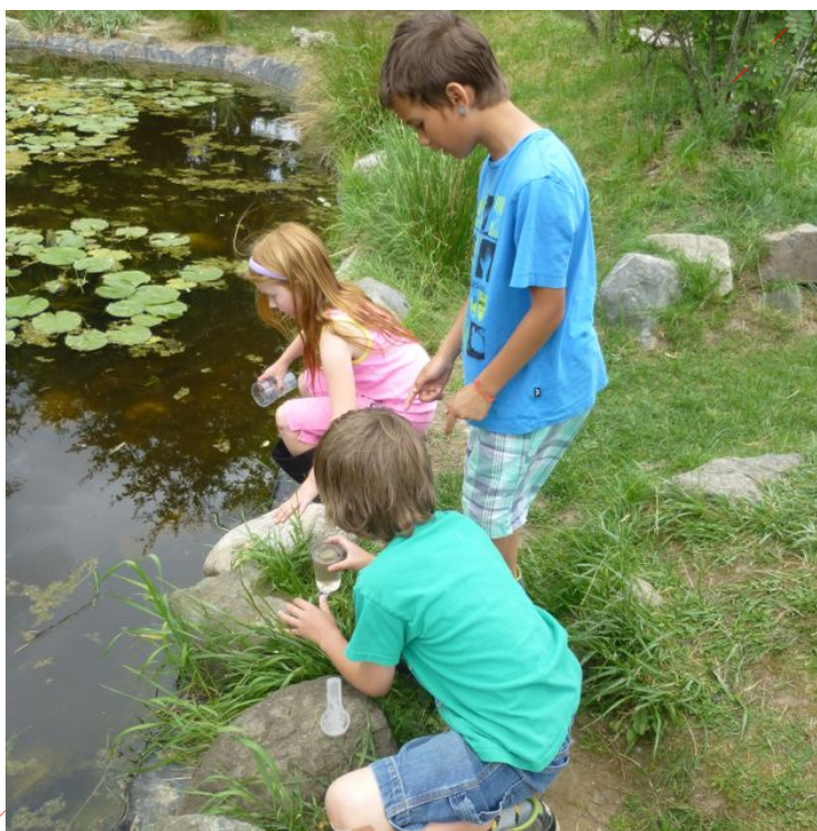
Elementary students in the Lopez Island School District conduct water sampling and search for aquatic insects at Rishi Pond, one of the many outdoor classroom sites on campus.

Most LISD students are engaged in extracurricular sports, which is significant because, as island residents, they must carefully manage their time due to ferry schedules. LISD offers weeklong seminars on specific topics, known as intensives. Many students choose options that emphasize being outside and physical stamina: rock climbing, wilderness survival, personal fitness, and biking the San Juan Islands.