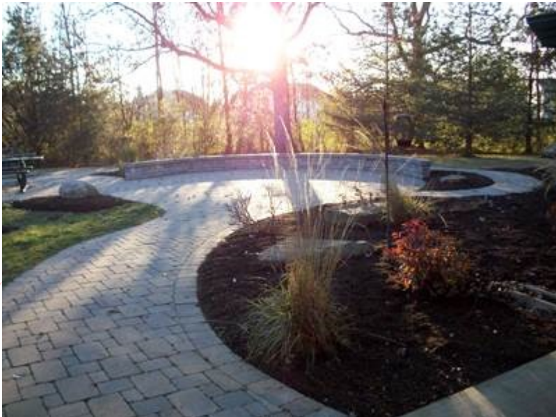
Through a partnership with the Lake County Forest Preserve, Meadowview Elementary School fourth graders learn about invasive plant species and cut down buckthorn in the campus woodland each fall.

Health education and wellness is another priority at Meadowview School. Monday Morning Fitness is a whole-school weekly exercise program. The occupational therapist and physical education staff designed a movement and learning lab. Classroom teachers take the students to the lab for movement breaks, which focus on fine motor, gross motor, balance, cross-midline, and visual motor integration activities. The physical education staff sends home a family challenge in which students focus on being active with their families. Challenges to date have included a family one-mile walk, a play in the snow, and a tracking of the fruit and vegetables eaten over the weekend. Students return each week with their challenges completed and with pictures of their families exercising together. Partnerships with local businesses facilitate free physicals, vaccines, vision checks, and dental exams.