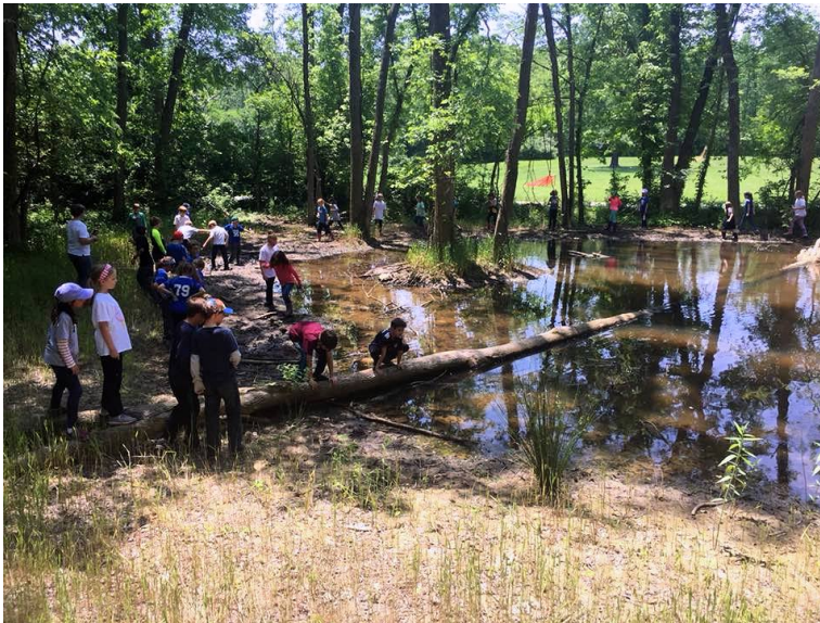
In their science curriculum, Saint Agnes students learn about how wetlands act as natural buffers, provide critical habitat for wildlife, mitigate flooding and help improve water quality. Saint Agnes students in grades 3-5 created and now maintain natural wetlands on campus.

Prekindergarten, kindergarten, and first-grade students take part in the Minds in Motion curriculum, a kinesthetic approach encouraging students to integrate motion into the learning process, both in the classroom and on the campus green space. In