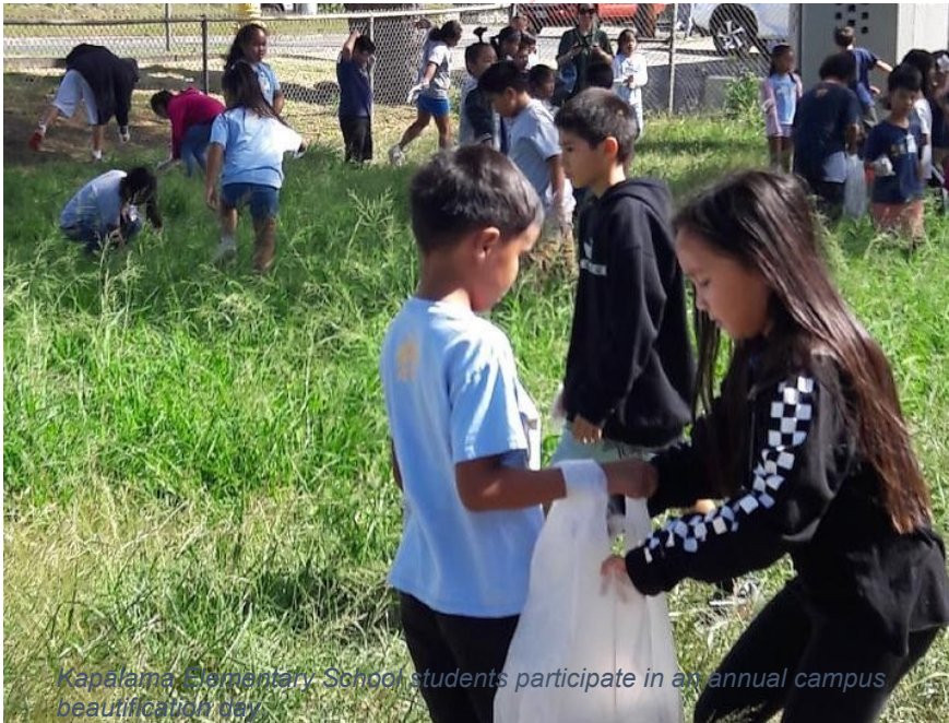
Kapālama Elementary School students participate in an annual campus beautification day.

Kapālama has reduced its footprint and expenses with a statewide, multidimensional energy program called Ka Hei, which includes energy-efficiency measures, renewable energy additions, and behavioral change. KES has reduced nontransportation energy use over two years by 68 percent and greenhouse gas emissions by 45 percent.