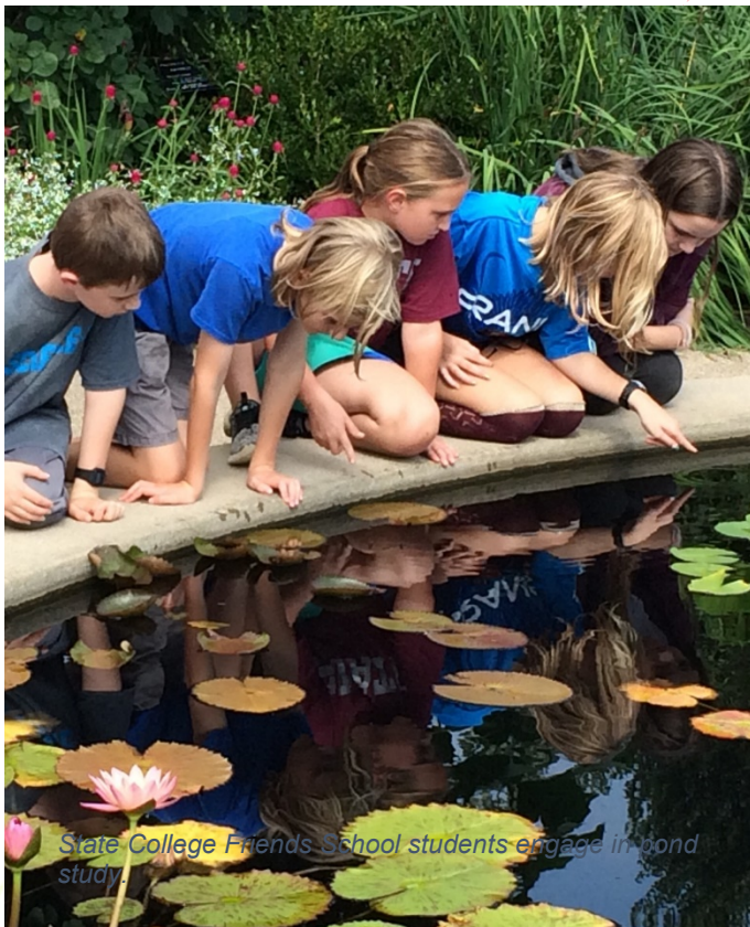
State College Friends School students engage in pond study.

Parents are asked to provide children with weather-appropriate clothing and gear, including hats, gloves, snow pants, boots, and sunscreen. Children from kindergarten through middle school go outside for recess on all but the most bitter-cold days.