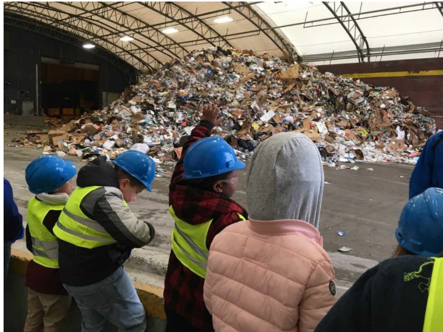
The Tates Creek Elementary Green Creek team visits the materials recovery facility in Lexington, Kentucky, to see how the school's recycling is sorted and shipped.

A regular recycling schedule has been established on Tuesdays and Thursdays. Small recycling bins have been replaced with large outdoor municipal waste receptacles that the school converted to recycling dumpsters. TCE ordered more class bins and now has one in every classroom and office.