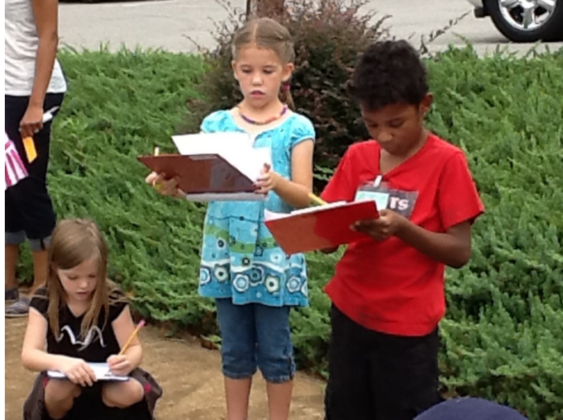
Dutch Fork Elementary School's curriculum aligns with state standards by grade level, following a themed continuum titled "from the mountains to the sea" that explores the South Carolina landscape within a global context.

The school initiated a food waste and compost program to divert waste from landfills. In the process, students collected data to show how much waste has been diverted in a given month. Current projections put food waste diversion at 5,000 pounds per month and a decrease in hauling fees of approximately $1,700 per year. Regular trainings are offered to the school community, with students as the leaders.