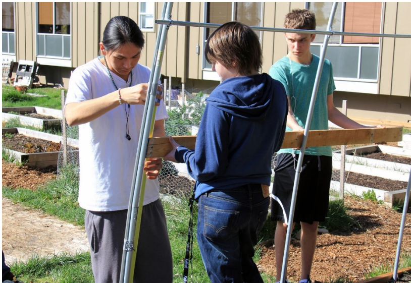
Students at Emerson High School in Lake Washington School District work to finish a hoop house as part of the Green Sustainable Design Technology class.

Since the 2005–06 school year, LWSD has reduced electricity usage per square foot by 30 percent. Natural gas usage has decreased 37 percent. Benchmarks were reset in 2014. Since then, LWSD has reduced energy usage by 11 percent. LWSD's resource conservation management program has focused on water conservation initiatives since 2008. Since then, LWSD has decreased domestic water usage 30 percent per student, and irrigation water usage by 80 percent. Native plants are used in all landscaping. Irrigation is provided only for secondary school playfields and two elementary schools where fields are used by community