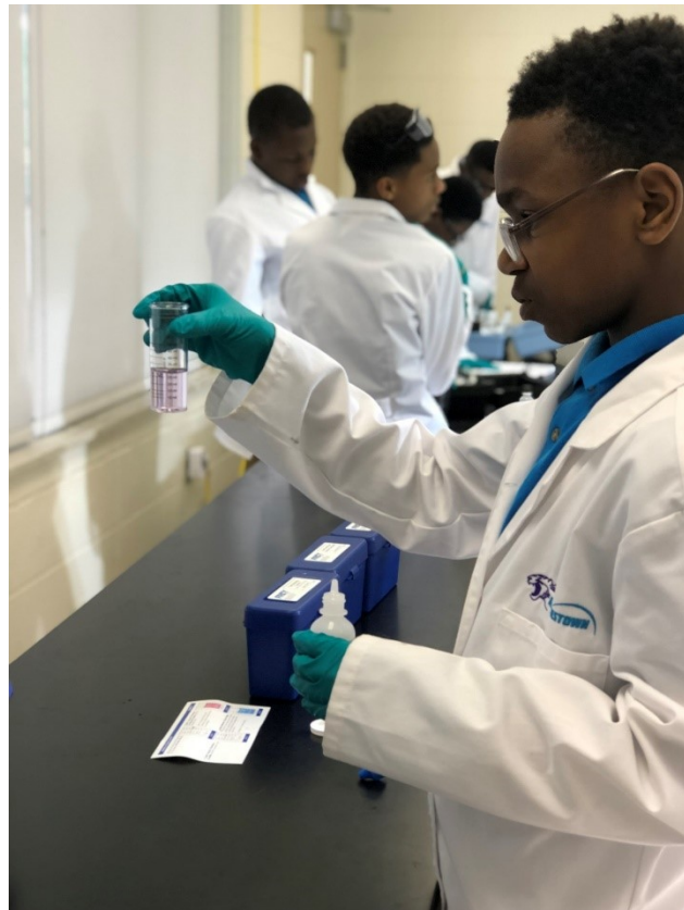
At Brookstown Middle School, the aquaponics class oversees all water quality testing, data recording, and calculations.

Nutrition also is supported through the school's robust aquaponics program. During the 2017–18 school year, students harvested 21 different types of lettuce from the aquaponics program, resulting in over 120 pounds of lettuce grown and served to students in the BMS