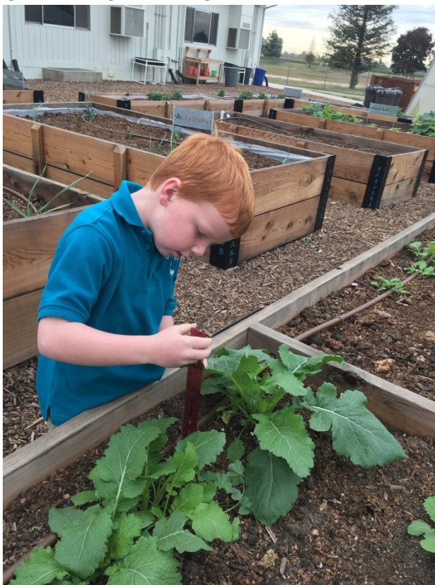
A Quail Lake first grader collects data in the garden, using a ruler to measure plant growth.

School grounds include 4,000 square feet of garden space featuring an outdoor classroom environment, a 2,000-square-foot butterfly garden, and planter beds in the front of the school that provide students with opportunities to study fruit production and plant management. The garden includes a 17 x 35-foot greenhouse to which all students have access and can use in various ways. Students in kindergarten through fifth grade visit the garden every two weeks for garden lessons led by their teacher and the school's science instructional support provider. Lessons not only focus on gardening skills, but also tie into the California NGSS and California Common Core State Standards that are being taught in the classroom.