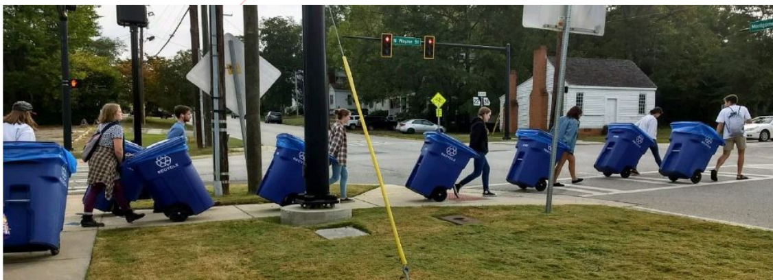
Georgia College and State University students bring recycling into the community during the Deep Roots Festival.

The Office of Sustainability (OOS) is responsible for campus sustainability initiatives; promoting education and outreach; and offering opportunities for internships, volunteering, service learning, and community service. The OOS has provided some 30 internships with over 10,000 hours of service, including opportunities for experiential learning, leadership, and professional development, all while having a positive and tangible influence within the campus community. Partners include the Sustainability Council, the Sustainability Fee Program, the Campus Kitchen at Georgia College (CKGCSU), the gardening club, and the environmental science club.