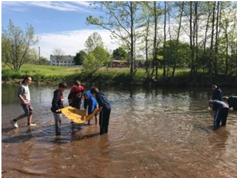
Fourth-grade students at Holland Brook school go on a river field trip and evaluate water quality based on organisms present.

filling stations. Student recess time has been doubled, and all teachers incorporate brain breaks, with activities such as GoNoodle, into classroom learning, a bonus to