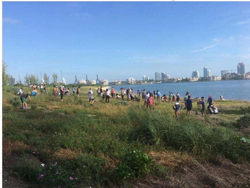
MAST Academy Green School Champion volunteers conduct beach cleanup and coastal restoration at Virginia Key with Frost Museum of Science.

In 2018, the PTSA partnered with the Phillip and Patricia Frost Museum of Science to create a Green Champions program that recognizes MAST students at an end-of-year ceremony for dedicating community service hours toward sustainability efforts. Students who attend monthly Green Champion meetings, MAST workdays, and Frost Science coastal restoration days on Virginia Key, as well as dedicate community service hours to environmental or health and wellness programs at MAST, receive bronze, silver, or gold recognition for their achievements.