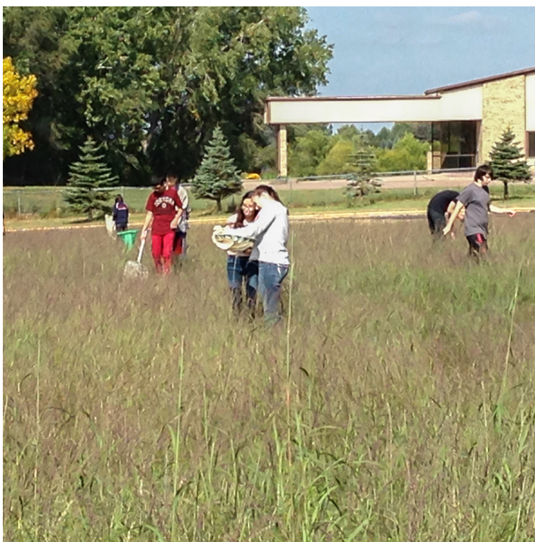
In Sioux City Community Schools, North High students engage in a safely conducted prairie burn in order to study its ecological effects.

The Sioux City Community School District participates concurrently with the ENERGY STAR Portfolio Manager and Energy CAP to track utility use.