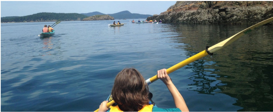
Northwest School students participate in a late spring outdoor program overnight kayaking trip in Puget Sound.

There is no car parking for students and few spaces for faculty. All are encouraged to use the lowest carbon transportation possible. The school provides a secure bicycle shed with a capacity of several dozen, as well as highly subsidized public transit passes for faculty. The school encourages carpooling among students and faculty by making a carpooling app available. Students in the environmental student group organize an annual bike and walk to school day to raise awareness for lower carbon transportation. Students collect data on how their peers commute throughout the week.