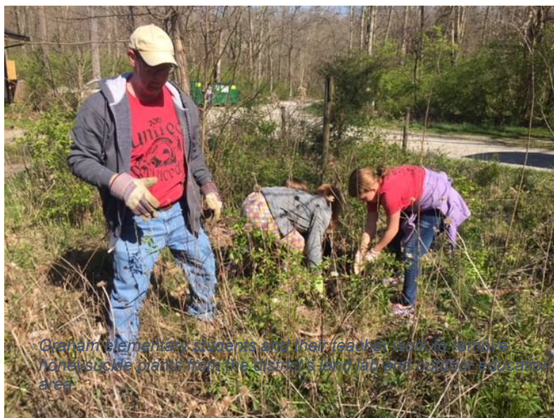
Graham elementary students and their teacher work to remove honeysuckle plants from the district's land lab and outdoor education area.

Probably the most exciting development has been students' work on a solar array to power the middle and elementary schools. This solar array will be installed in 2019, after a yearlong study with partners at Energy Optimizers and the long-term effort of Graham students, most notably the energy team at the middle school. The students worked with partners to design and develop a solar plan that will provide 75 percent of the electrical needs at both buildings through a power purchase agreement. Upon