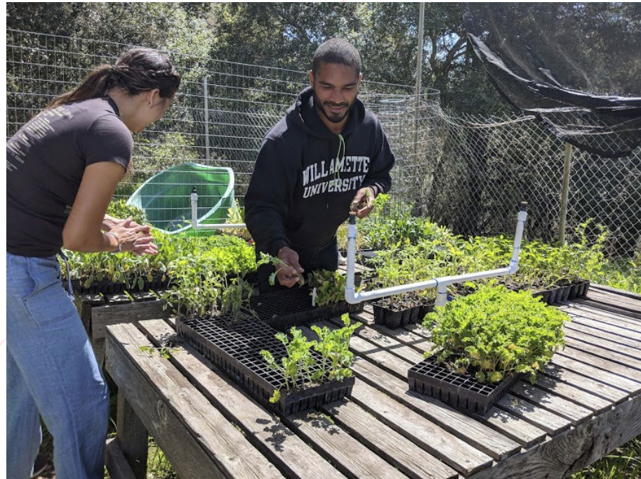
Local high school students and staff from local nonprofit One Cool Earth provide Carrisa Plains with starters for their garden.

students will use recycled resources to build and install animal homes throughout the campus. Students in kindergarten through second grade have begun creating bird feeders to provide additional sustenance to the local birds.