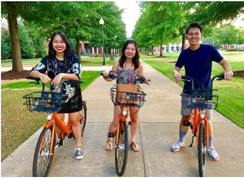
The Troy University SPIN program provides healthy, no-emission alternative transportation for students on campus and in the community.

The university provides the Trojan Shuttle Service, encouraging students, faculty, and staff to take advantage of alternative transportation both on and off campus. An expanded array of alternative transportation options goes beyond the bus system and include an app-based bike and scooter program. This service provides 100 bicycles and approximately 20 scooters.