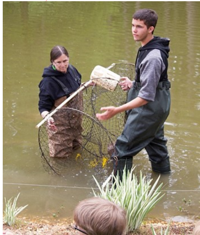
Douglas Byrd High School Academy of Green Technology students offer environmental education outreach to the public.

Supported by a recent grant, AoGT and the school's culinary-arts students have developed the Communities in Bloom initiative to teach gardening and help the local community grow its own fresh food. Students involved in the initiative provide containers, seeds, and