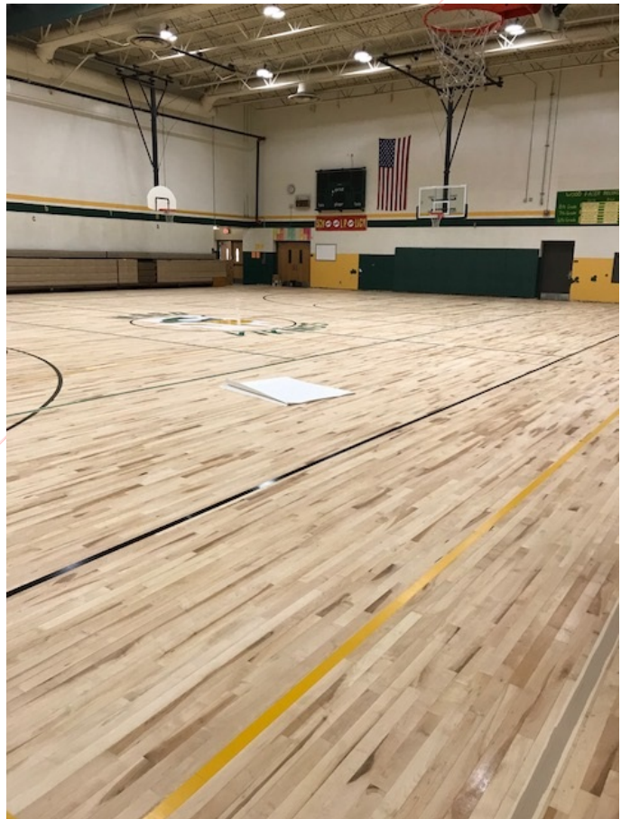
The wood for these Davenport Community School District gym floors came from a processing mill in Merrill, Wisconsin; and these maple trees came from Wisconsin and Michigan. Sourcing wood regionally cuts transportation distance, and, therefore, emissions.

Davenport Schools has implemented a school-based mental-health model. Through face-to-face contact, as well as phone calls and email, Davenport's learning supports specialist for prekindergarten through 12 th grade, as well as a the Project AWARE mental health manager, coordinate with several community organizations to make referrals, provide consultations, and/or discuss collaborative efforts to meet the needs of students and families. Davenport also has a partnership with the Vera