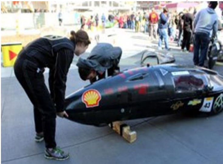
Goshen High School Super Mileage Team goes beyond the usual shop class. Cars are designed to achieve 1,000 miles per gallon.

In 2009, district administrators implemented an energy conservation program in collaboration with Cenergistic, and they have hired a full-time energy education specialist to guide the program. During the first year, Goshen gathered baseline