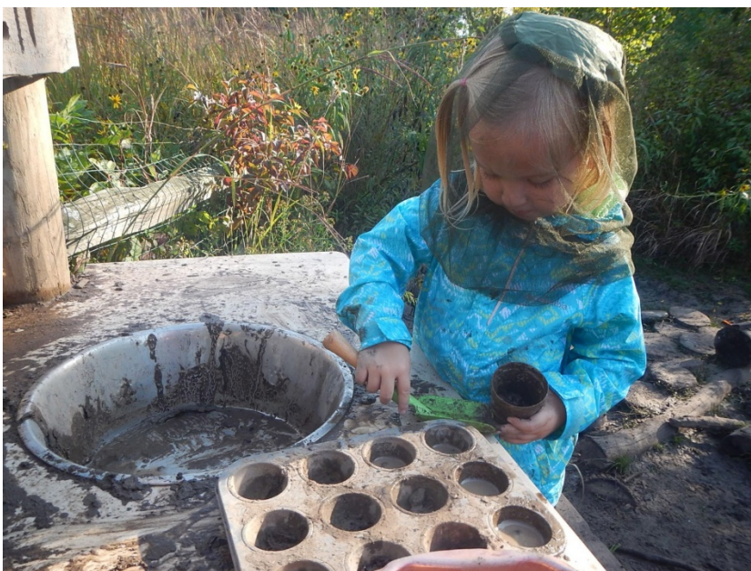
Muffin making in the mud kitchen at Schlitz Audubon Nature Preschool supports counting skills and imaginative play.

The preschool uses as many recycled, upcycled, natural, and environmentally sustainable products in the classroom as possible, from educational materials to cleaning supplies. The preschool teachers make a point of reducing, reusing, and recycling in classrooms and teaching this behavior to students. The preschool uses an educational three-bin compost system, and it aims to become a zero-waste school either by repurposing materials, such as play dough and paper, into new art projects; or by recycling; or by composting everything eaten. Schlitz has a dishwasher and sanitizer that allows the school to avoid paper plates and utensils, and the school serves food family-style.