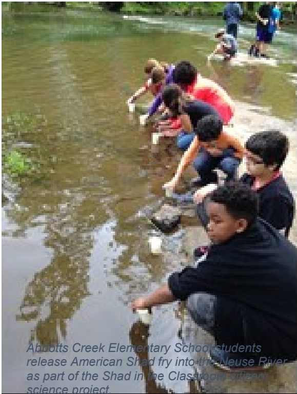
Abbotts Creek Elementary School students release American Shad fry into the Neuse River as part of the Shad in the Classroom citizen science project.

The school was designed and constructed with a stormwater runoff retention pond to help settle sediments before they can enter a nearby stream. Multiple stormwater drains around campus lead to the retention pond. The pond is an approximate one-acre wetland, which collects and treats stormwater runoff from the approximately 20-acre campus. Because a wet detention basin dilutes and settles pollutants in the initial runoff from a storm, the concentration of pollutants in the runoff released downstream is reduced.