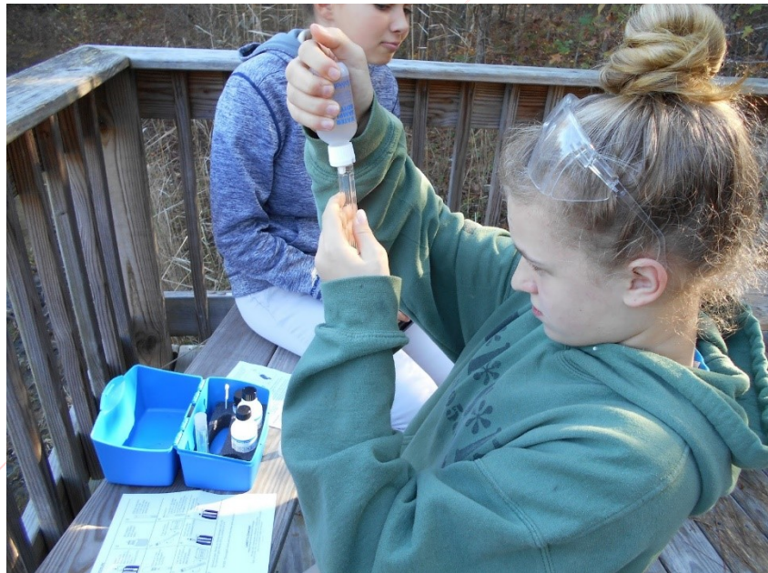
As part of their environmental education, students The Jefferson School test local water quality.

Since 2010, Jefferson has cultivated alliances with regional partners to build a nature-centered, active curriculum. Partners include the Delaware Nature Society, the University of Delaware College of Marine Studies, the Lewes Historical Society, Delaware Tech, Delaware Department of Natural Resources and Environmental Control solar car and bridge challenges, the Delaware Bee Keepers Association, Delaware Wetlands, Nanticoke Watershed Alliance, Stash Your Trash, Delaware Inland Bays, Oceana, Delaware Native Plants, Parkside High School Horticulture Department, Echo Hill Outdoor School, iNaturalist, and the National Phenology Network.