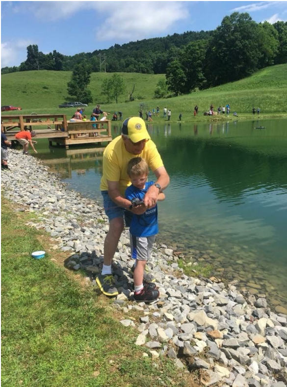
Junior Elementary School works with community partners to offer outdoor education, particularly for its fly fishing days.

The school participates in an Adopt-A-Highway project each spring. Students take a leadership role in collecting and disposing properly of trash and litter along the roadway between the river and the school.