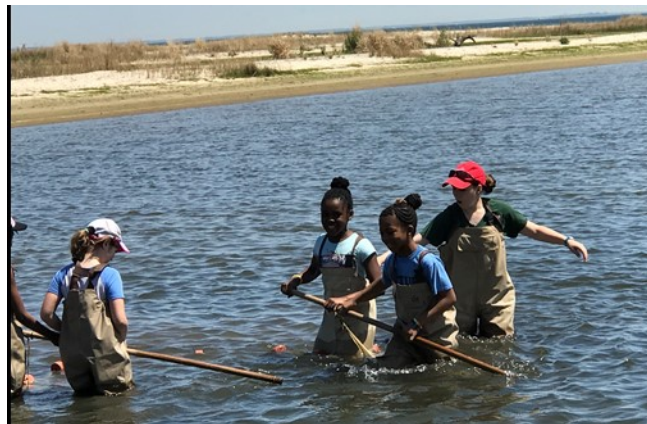
Calvert County Public Schools third grade students seine to look for potential sources of food for diamondback terrapins to determine whether Flag Pond would be an appropriate release site.

The whole district pest management policy permits pesticides to be used only after determining that the nontoxic options are unrealistic or have been tried unsuccessfully. The least hazardous pesticide is then selected, with the potential for exposure minimized. All school custodial cleaning agents are nontoxic.