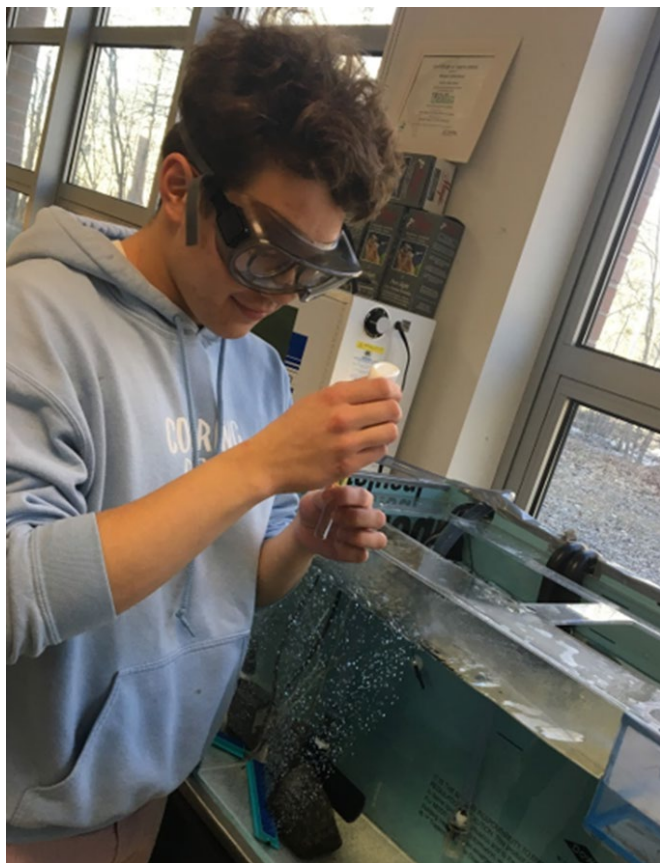
A Weston High School AP Environmental Science student experiments with a trout habitat as part of Trout in the Classroom participation.

In addition to its commitment to educating students about sustainability, Weston High also is committed to teaching them about the environment. This is evident in the high priority placed on the health and well-being of students, as well as in the creation, structure, and operations of Weston High. When the school added a new science wing in the past decade, officials built to LEED Silver certification standards.