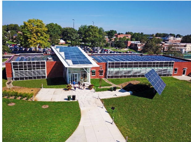
In its first few months of operation, the Lombardo Welcome Center at Millersville University has generated nearly three times more energy than it has consumed.

The Lombardo Welcome Center greets every visitor with a message of environmental stewardship. Excess energy is supplied to other campus buildings, reducing campus energy demand and greenhouse gas emissions while saving some $25,000 annually in electricity costs. Faculty from various departments brings their students through the building to explore green building design and discuss topics such as energy policy, sustainability, and innovation. In 2019, the university plans to conduct STEM workshops focused on advanced energy technologies for education majors, as well as for students from local elementary and middle schools.