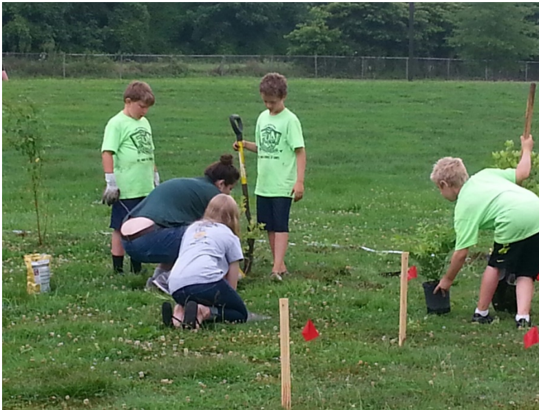
1At W. Reily Brown Elementary School, in Caesar Rodney School District, students and parents helped install the wetlands rain garden area.

Schools in the district are adding share tables and composting garden and cafeteria scraps. Grants support the installation of water-bottle filling stations (which are popular at CRHS), the successful reusable bags project at Frear Elementary, and the “No Straws Please” campaign at Nellie H. Stokes Elementary School, all of which reduce single-use plastics and promote proper hydration. The district’s network of EcoTeams, in partnership with the Delaware Department of Natural Resources and Environmental Control, the Delaware Solid Waste Authority, and Revolution Recovery, has begun a campaign to communicate how to “recycle right.” CRSD piloted its own student recycling training kit in its gifted education and enrichment program. Building custodians and students with special needs from the Charlton School are essential team members at each school as they help transport recyclables. These endeavors provide Charlton School students with practical vocational and critical life skills, while also providing inclusive time with the student population.