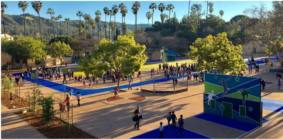
The Eagle Rock Elementary School campus is designed for green spaces, water conservation, temperature modulation, and active learning spaces.

As a result of learning about the garden, even the school's youngest students are familiar with complex scientific concepts like osmosis and the carbon and nitrogen cycles. They gain hands-on experience studying everything from the structures of plants to the life cycles of butterflies and the importance of bees. Students are taught the vital importance of agriculture throughout history in various civilizations. Working in the garden program and learning through trial and error gives them a real sense of the challenges other cultures have faced in providing food.