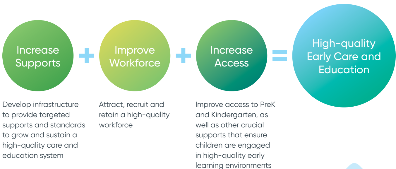
Figure 1: The Pathway to High-quality Early Care and Education

The Committee believes that the recommendations detailed below will enhance the State's existing programs and will require the complete cooperation of State policy makers, education, health and human services agencies and programs to implement with fidelity.