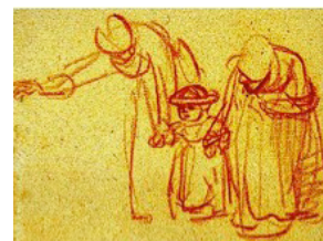
In this sketch from Rembrandt we see the woman scaffolding by supporting the child’s ability to take her/his first steps.

The procedural aspect of scaffolding emerges through the unplanned support that occurs in-the-moment and in response to something new the learner introduces in classroom interactions. The on-the-spot nature of procedural scaffolding makes it contingent on the learner and the particular situation in which it occurs. This means that in addition to continually monitoring students’ understanding, the teacher is also assessing their own structural scaffolds so as to be able to quickly modify them in order to support students’ progression to the ZPD. It is thus through the planned structure