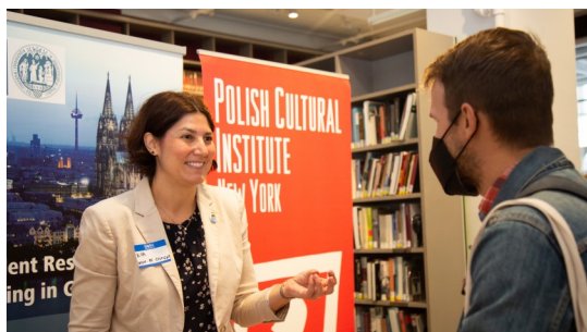
An exhibitor and an attendee discuss German programs.

Throughout the day, attendees were able to interact with various exhibitors representing organizations that support world language instruction, including various cultural institutes.