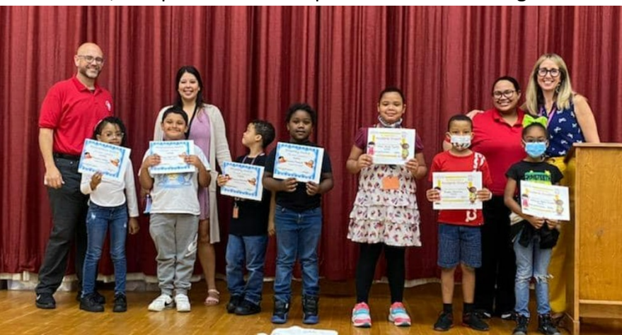
Students and staff celebration their achievement.