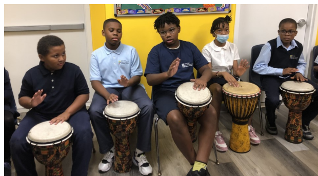
NYFACS students perform at the inauguration

For more information on NYFACS, please visit their website .