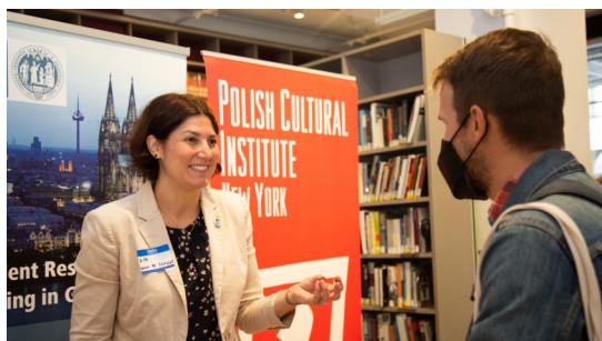
An exhibitor and an attendee discuss German programs.

Throughout the day, attendees were able to interact with various exhibitors representing organizations that support world language instruction, including various cultural institutes.