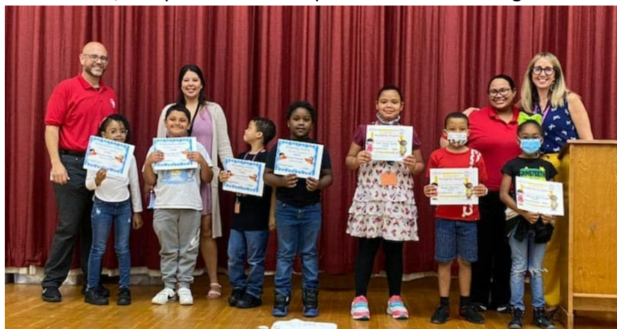
Students and staff celebration their achievement.