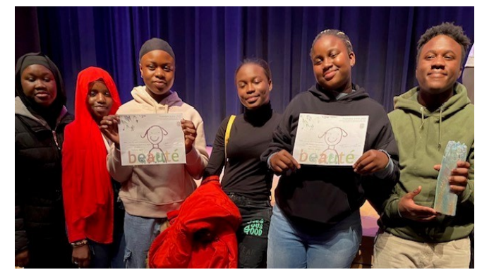
Students from International Community High School won the French Heritage Theater Performance Competition on February 4th, 2023

Vibrant small schools are committed to constantly finding organizations to expand programming options for our students. Other highly recommended organizations conduct similar initiatives of sharing students' stories and actively promoting the use of the home language or multiple languages to a wider audience; these organizations include The Glass Files and StoryCorps. The Glass Files also works with MetaBronx who is sponsoring work-based learning opportunities for several schools with large immigrant populations.