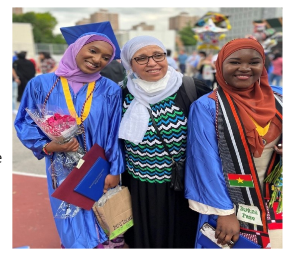
NYS Seal of Biliteracy recipients from International Community High School

Global awareness as students learn more about each other's different home countries, multiple home languages, and unique experiences with developing French language skills