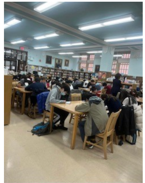
Participants in the Dictée Interscholaire