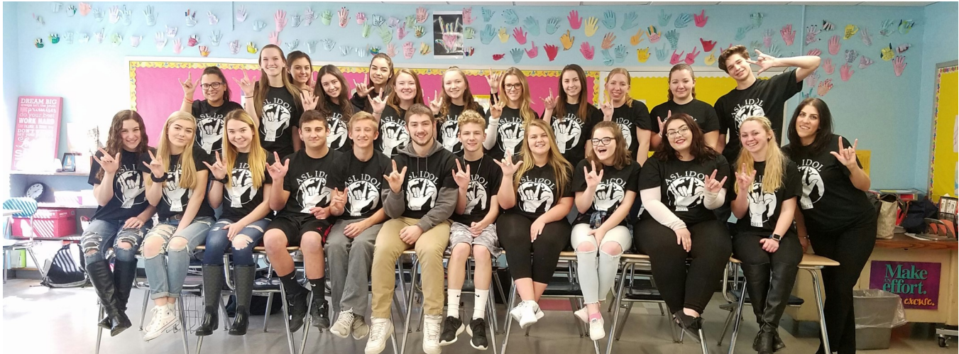
Participants in ASL Idol from East Meadow High School