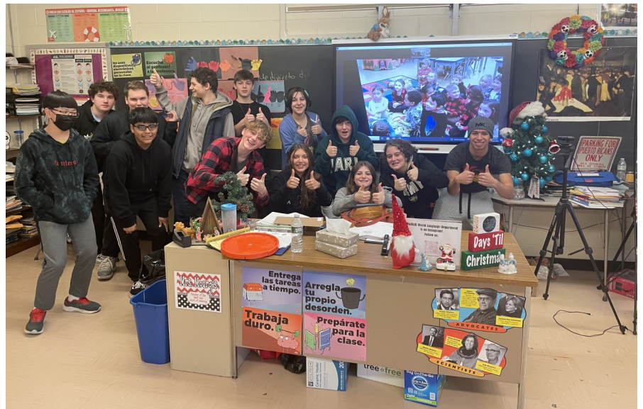
ASL students from Wallkill Senior High School