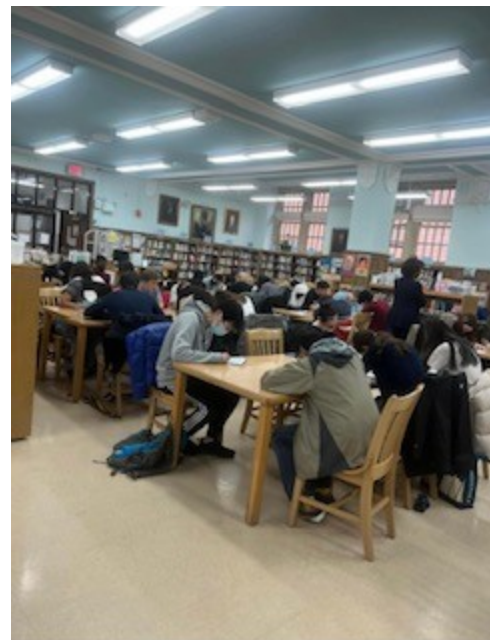
Participants in the Dictée Interscholaire