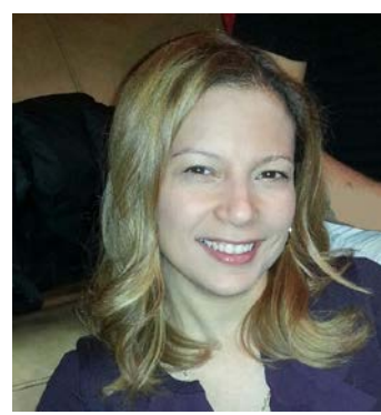
Associate Commissioner of Bilingual Education Angelica Infante-Green