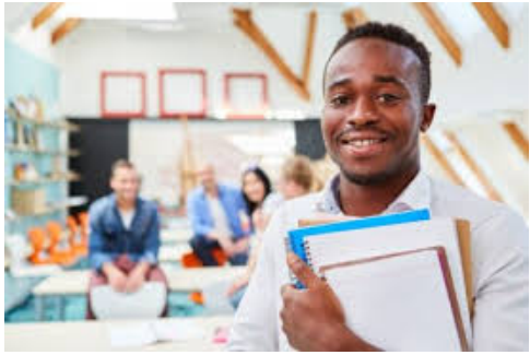
Newcomer English Language Learners (ELLs)