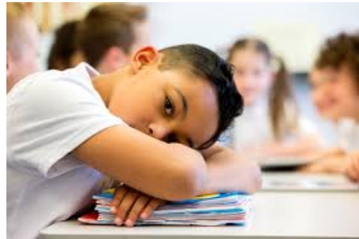
Students with Interrupted/Inconsistent Formal Education (SIFE)