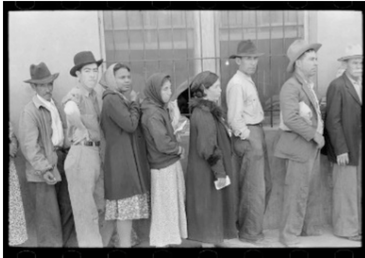
People waiting for food during the Great Depression (1939) 1

Guiding Question: Why did Roosevelt say "the only thing that we have to fear is fear itself"?