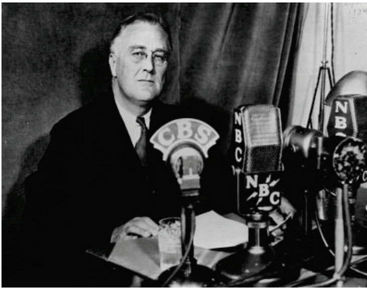
Franklin D. Roosevelt (1934) 3

During his inaugural speech , Franklin D. Roosevelt famously said: "...the only thing that we have to fear is fear itself." 2 With these words, Roosevelt gave people hope that the nation's problems were going to be resolved .