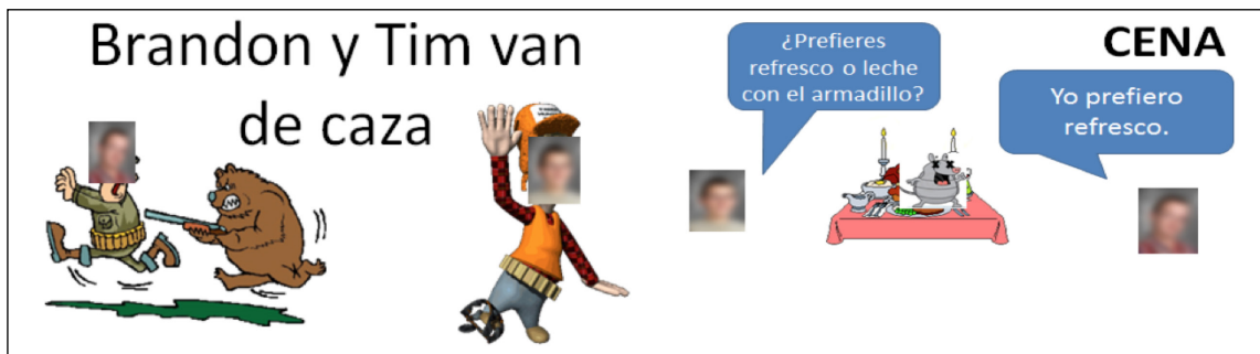
Figure 4: Artifact submitted by a teacher showing how two students used PowerPoint for a class assignment.

This teacher helped build student agency by providing topic and presentation choice. These two boys, from a rural, hunting community, chose to complete their Spanish vocabulary and sentence structure lesson using PowerPoint.