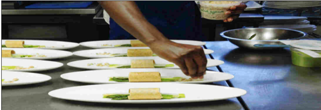
Figure 6: One teacher compared executive function skills to a chef managing a busy kitchen.

One teacher sent in a photo as part of her reflection demonstrating her understanding of executive function.