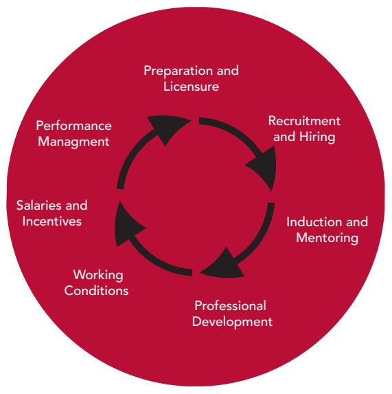
Figure 1. Educator Career Continuum

Copyright © 2008 Learning Point Associates