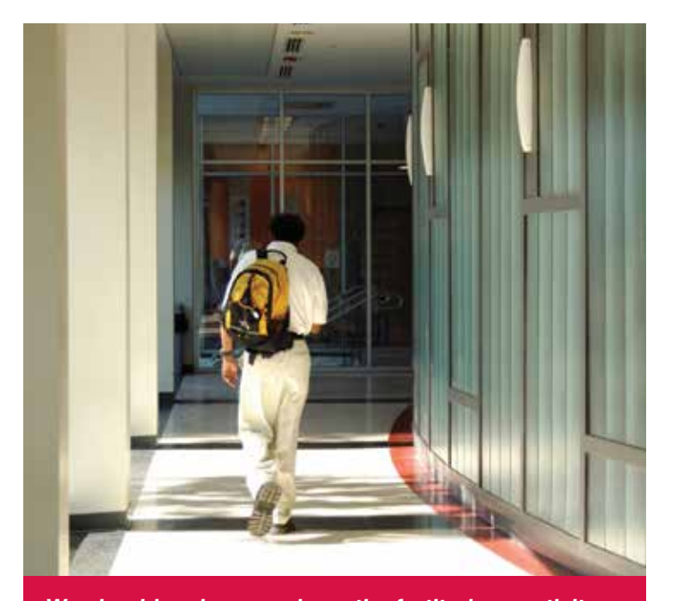
We should no longer rely on the fortitude, creativity, and willingness of a select set of institutions and states to produce this information, but rather should incorporate these metrics into federal and state data systems.

The field has spent the past decade refining a set of postsecondary metrics, with the goal of using these data to help advance student success. This experimentation has led to substantial consensus on what we should measure and how