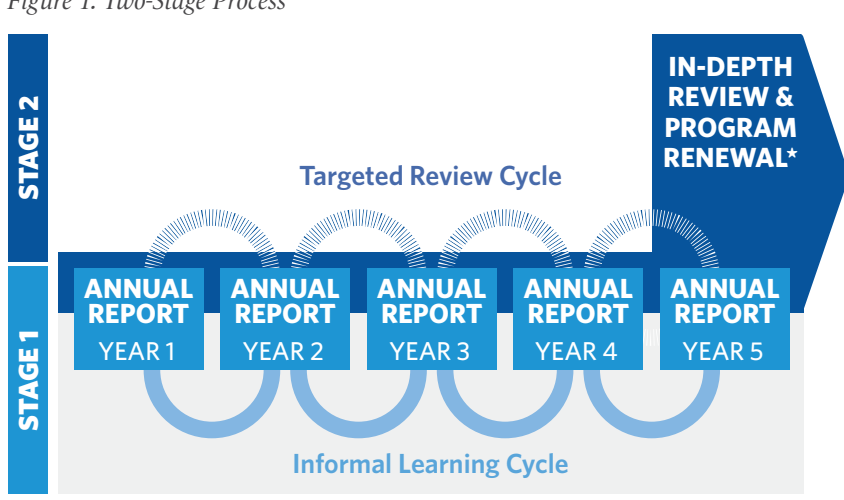
Figure 1: Two-Stage Process

Our recommended iterative, two-stage process is illustrated in Figure 1.