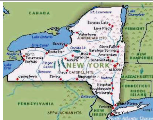
New York State, 2013