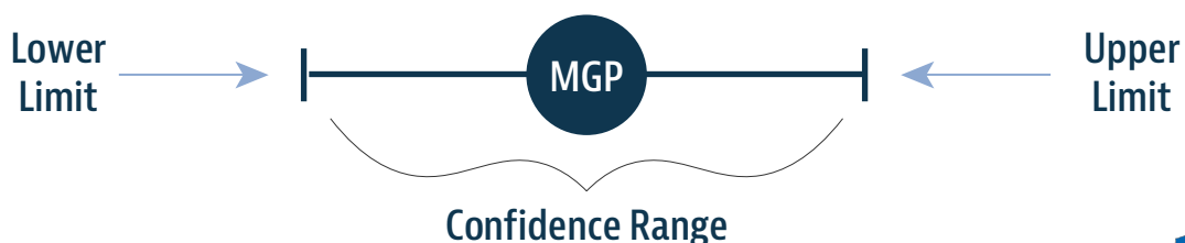
Figure 2. MGP & Confidence Range

MGPs also are reported with an upper limit and a lower limit that represents a 95-percent confidence range (see Figure 2 ).