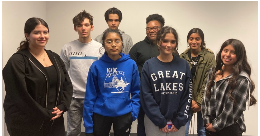
2023 Cohort of Capital District PR/HYLI Students Taking the HVCC course