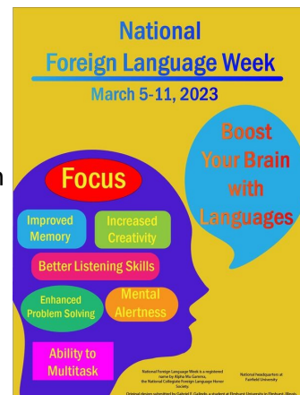
2023 NFLW poster created by Gabriel Emiliano Galindo from Elmhurst University

March is a special time to celebrate world languages in New York State, because March is not only National Foreign Language Month, but it is also when National Foreign Language Week (NFLW) takes place (March 5-11, 2023). Begun as part of a plan to raise awareness in the US of the need for and importance of world language study, this week is a time to celebrate and promote both the joys and benefits of learning a new language. World language educators are encouraged to submit information on how they are celebrating this week or month with their students for possible inclusion in our April newsletter. Submissions should be brief descriptions of the activity, may include a photo, and can be sent to obewldocsubmit@nysed.gov by no later than March 15, 2023.