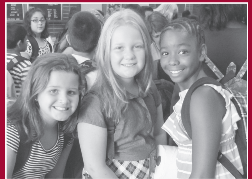
Students throughout the district were excited to return to school on Sept. 3.

We have also adopted the acronym VOICE to emphasize not only communication, but also ongoing priorities and an important upcoming project, Video on Demand, which we plan to roll out in the second half of the year. Our goal with VOD is to assemble